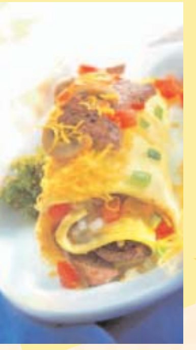
Looking for health-conscious alternatives? Ask for reduced cholesterol egg substitute, reduced colorie/diet syrup or a plain short stack of butternilk pancakes.